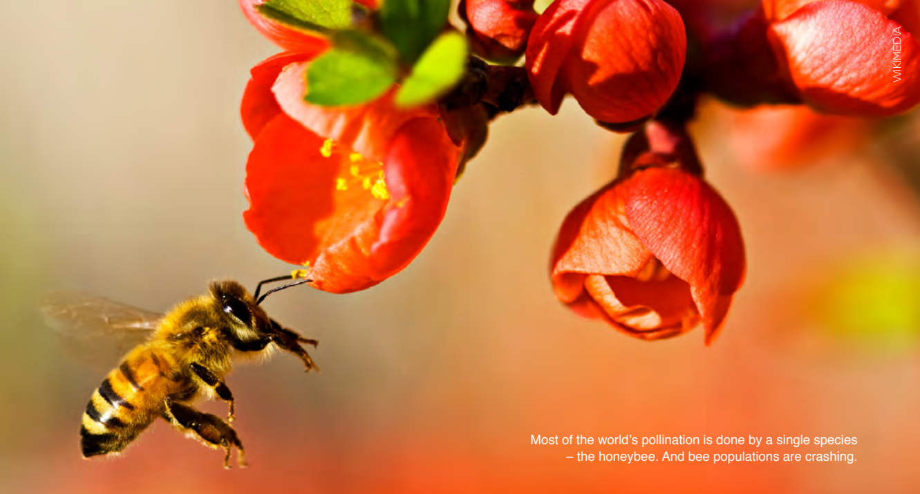
Most of the world's pollination is done by a single species – the honeybee. And bee populations are crashing.

ecology – the logical conclusion is that all biodiversity can be considered under the umbrella of 'biowealth'.